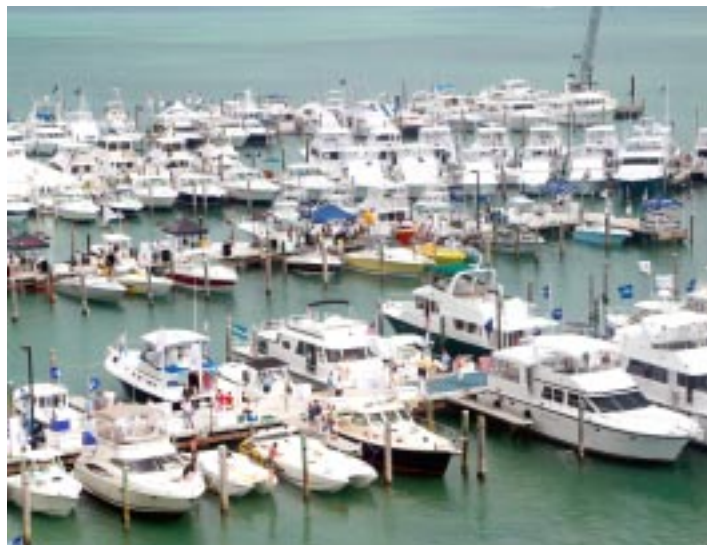
Sealine Marina and Yachting Center during last year's show

Big Game Room: Boat show organizers are teaming up with celebrity anglers and big-game professionals to create a Big Game Room, which will serve as a gathering place for fishing enthusiasts. Visitors can participate in fishing seminars and see product demonstrations led by tournament organizers. The Big Game Room will be in the east mezza-