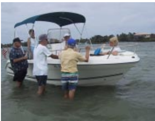
At the most recent Nose-Up on The Loxahatchee on Halloween weekend, the low tide and the Squadron were slightly out of synch. But there was so much fun and food to be enjoyed that nobody complained about getting their ankles wet.

Member's Club was a sellout, with some 100 members attending.