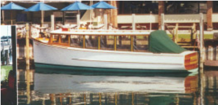
Pointer is a restored 38-foot boat powered by a 75 HP diesel engine, and was built in 1934.

Since we were going to spend our summers here, Clive [P/D/C, D/8] looked to see if there were any squadrons nearby. He found that the Tip of Mitt Squadron was within our area, so he contacted them. They were a provisional squadron until three years ago, and now have 35 mem-